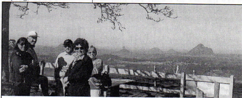
A group of Moree members in an area overlooking the Glasshouse Mountains

On Sunday we travelled up onto the Blackall Range for morning tea and a spectacular view of the Glasshouse