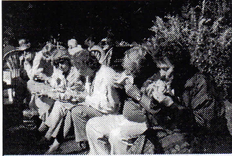
Steak Burgers at Wappa Dam

featuring barbecued steak burgers. Our return trip took us via Eumundi to Noosa Heads where we had time for a stroll on the boardwalk along the beach and along the well-known Hastings Street.