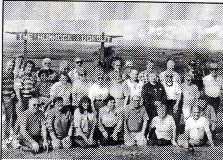
Post-Rort Tour group at The Hummock Lookout, Bundaberg.

Wednesday , with everyone in surprisingly good shape, and after an early morning call by ‘The Rooster’ as he apparently flew past our balconies, we headed south for the Town of 1770 to meet ‘Betty on the Jetty’ and ‘Des on the